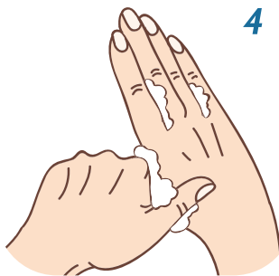
Rotational rubbing of right thumb clasped in left palm and vice versa