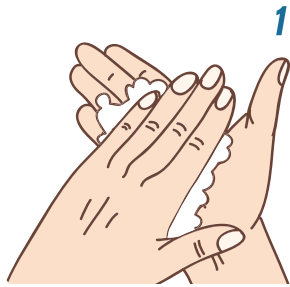
Palm to palm