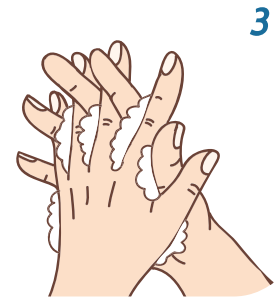
Palm to palm, fingers interlaced