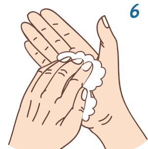
Rotational rubbing, backwards and forwards, with clasped fingers of right hand in left palm and vice versa